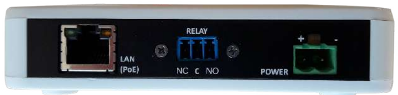
ZONITH RELAY MODULE INSIDE BTR-01B