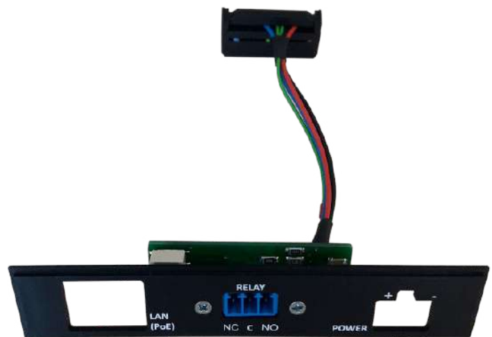
ZONITH RELAY MODULE